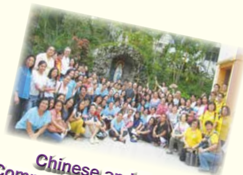
Chinese and English Community group picture after the Living Rosary