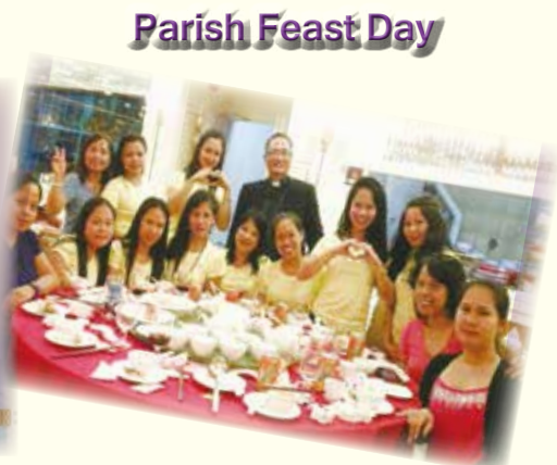
Parish Feast Day