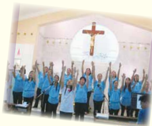
Closing Prayer and songs Service for the month of Mary